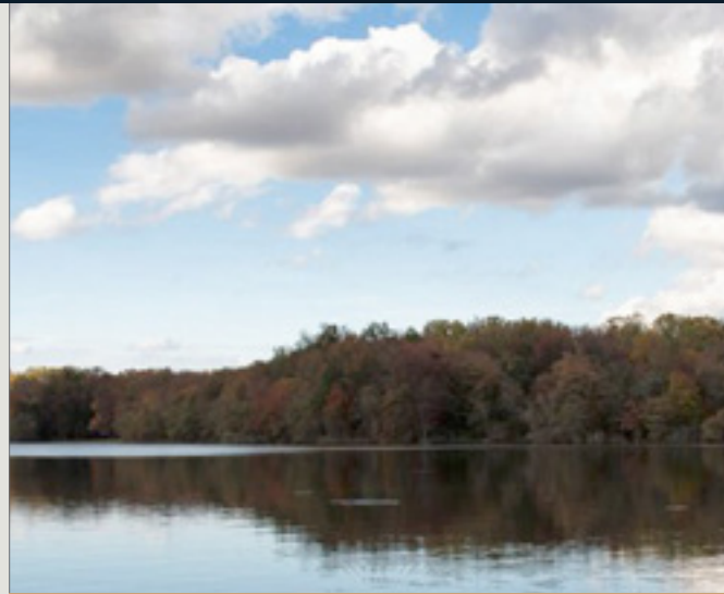
Pictured Above: Lums Pond

Ask one our leasing professionals for more details about our Preferred Employer Discount program.