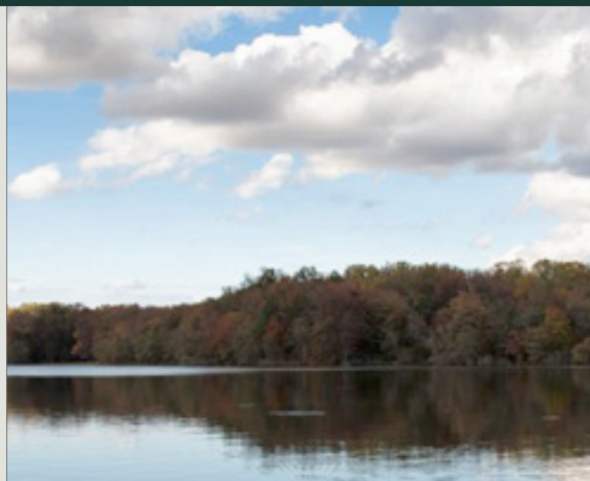
Pictured Above: Lums Pond

Ask one our leasing professionals for more details about our Preferred Employer Discount program.